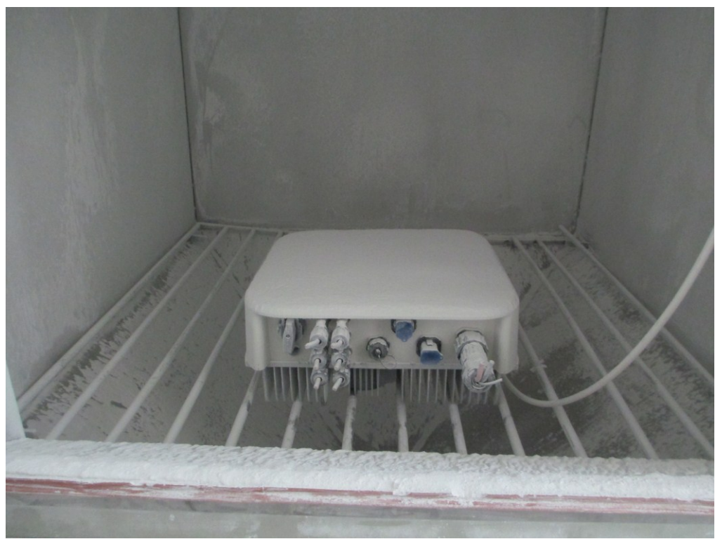
Test setup of IP6X