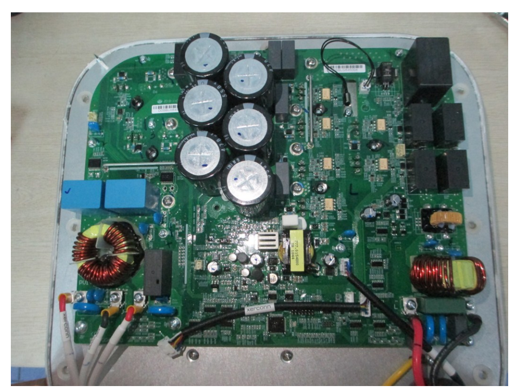
Checked after test finish

Appendix Photos: Report No.: 181016133GZU-004