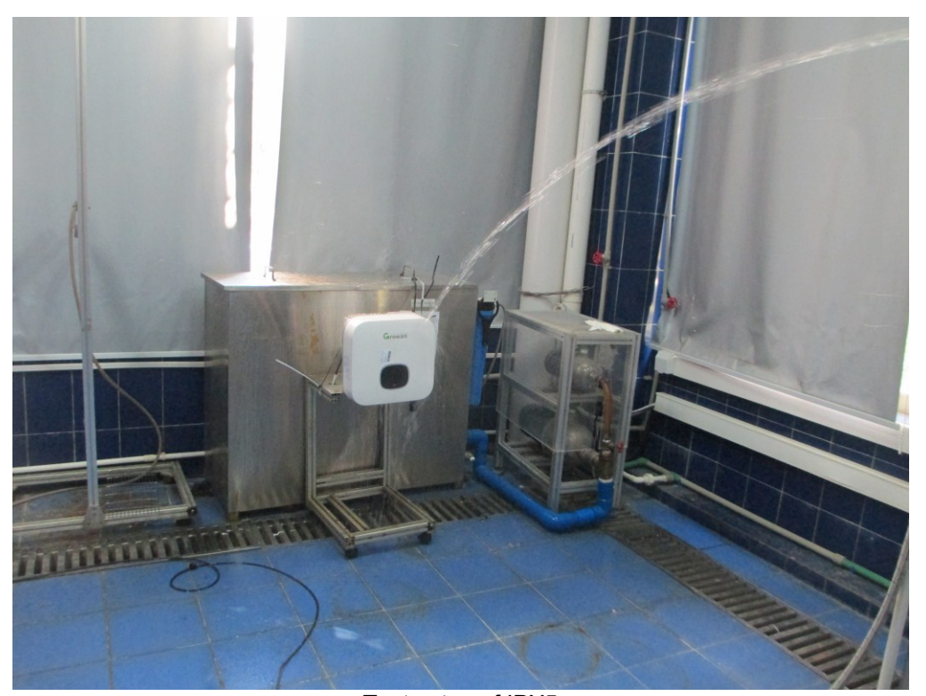
Test setup of IPX5

File No.: General-ACCE-001, date: May 2016